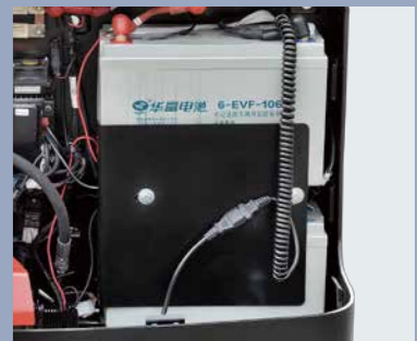
Built-in charger and maintenance free gel battery, you don't need to worry about them