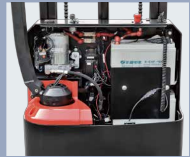
Fully opened hood, easy accessibility of all components, is easy for service