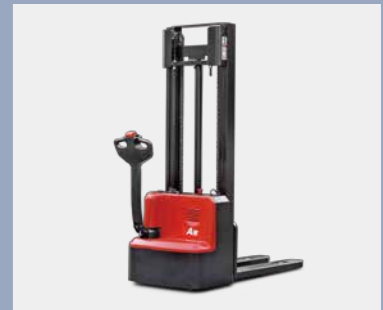
Optimized designing structure to offer a good visibility and easy entrance to the pallet