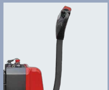
Simple and beautiful tiller designed to improve the operator's driving comfort